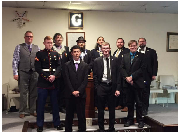
PSMC's and PIKC's in attendance.