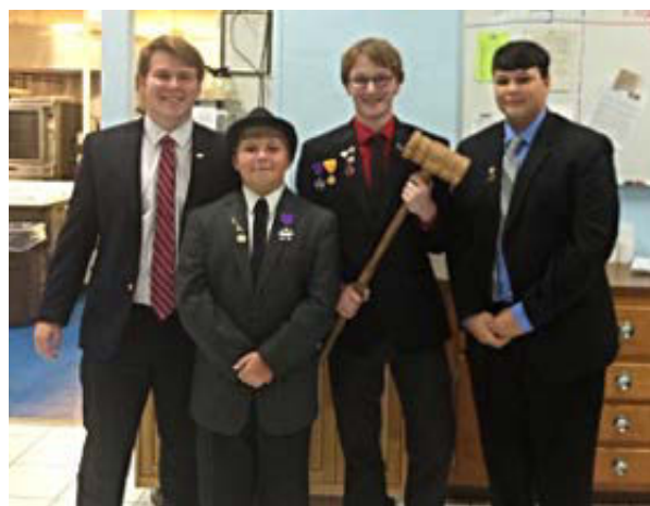
Anclote Chapter Proudly SHows Off the District 4 Travelling Gavel

(The visiting chapter does not have to have more members than the the chapter holding the gavel. This is so that the gavel travels more rather than being stuck at one chapter).