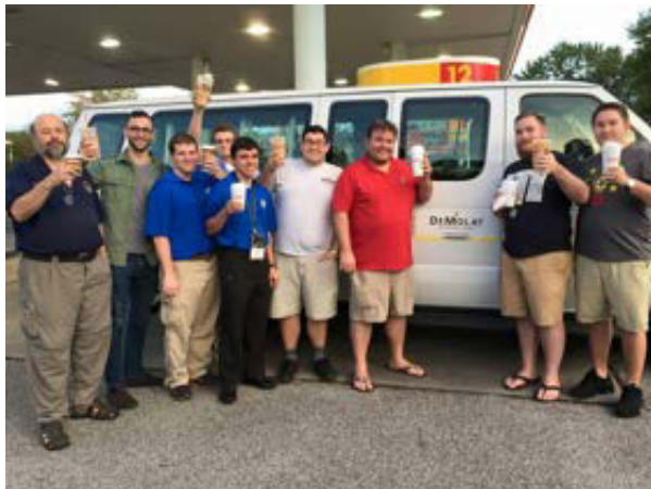
Florida DeMolay Runs on Dunkin!