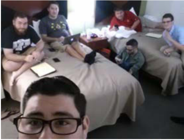
Relaxing after the meetings

We also had several jurisdictional meetings throughout the weekend. Be ready for some announcements in the coming weeks!