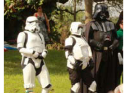
Shrine Nobles from all over and the occasional stormtrooper and Sith Lord.